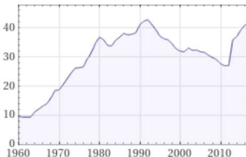
Forcible rape rate history:

UCR rape rates not adjusted for uncovered under-counting retrieved via WolframAlpha